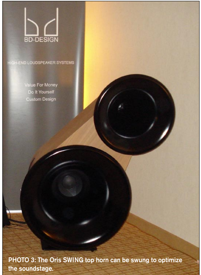
PHOTO 3: The Oris SWING top horn can be swung to optimize the soundstage.