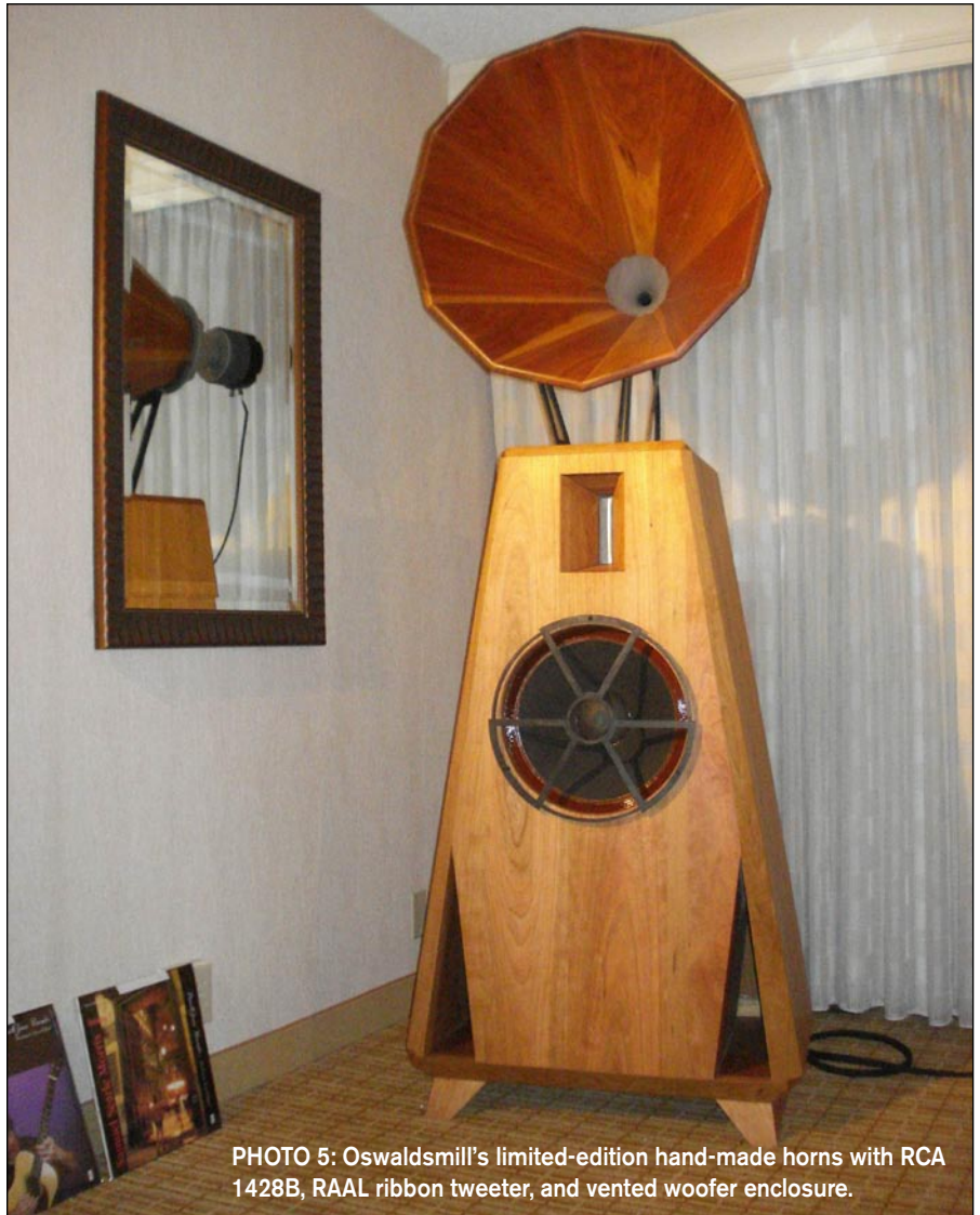
PHOTO 5: Oswaldsmill's limited-edition hand-made horns with RCA 1428B, RAAL ribbon tweeter, and vented woofer enclosure.